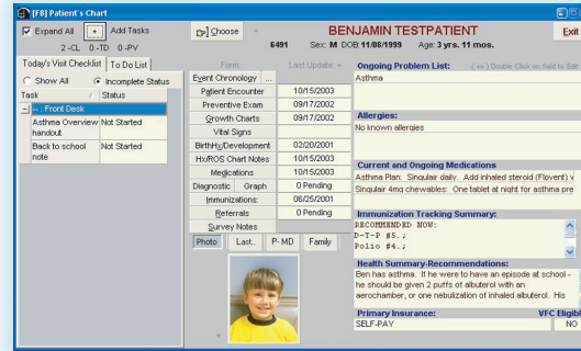
Electronic patient chart

Congratulations! You have discovered Office Practicum, a robust pediatric Electronic Medical Records (EMR) and Practice Management System (PMS).